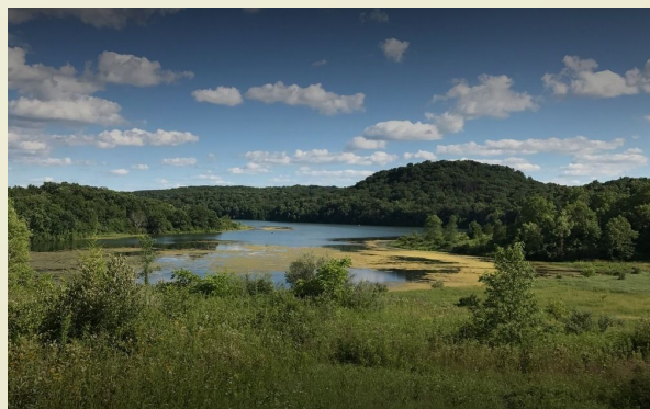
Governor Dodge State Park

Our budget remains within our request for the 2024 year. Expenditures by July were at 51%.