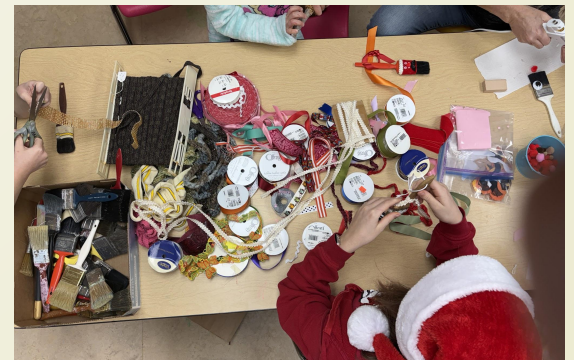
Nifty Gifty