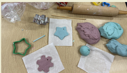
Nifty Gifty

As I write this, I'm looking forward to our Solstice bonfire and the intergenerational Symbol Tree Service this weekend. Joyous holidays to all!