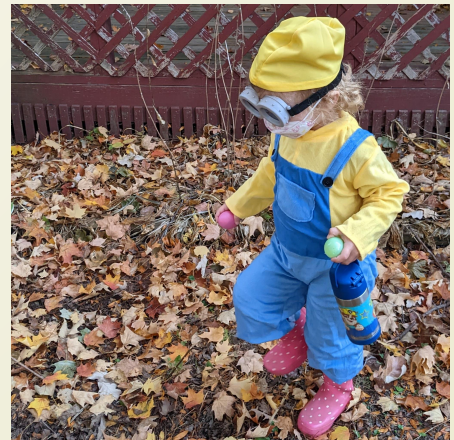
A minion gathering Halloween eggs.