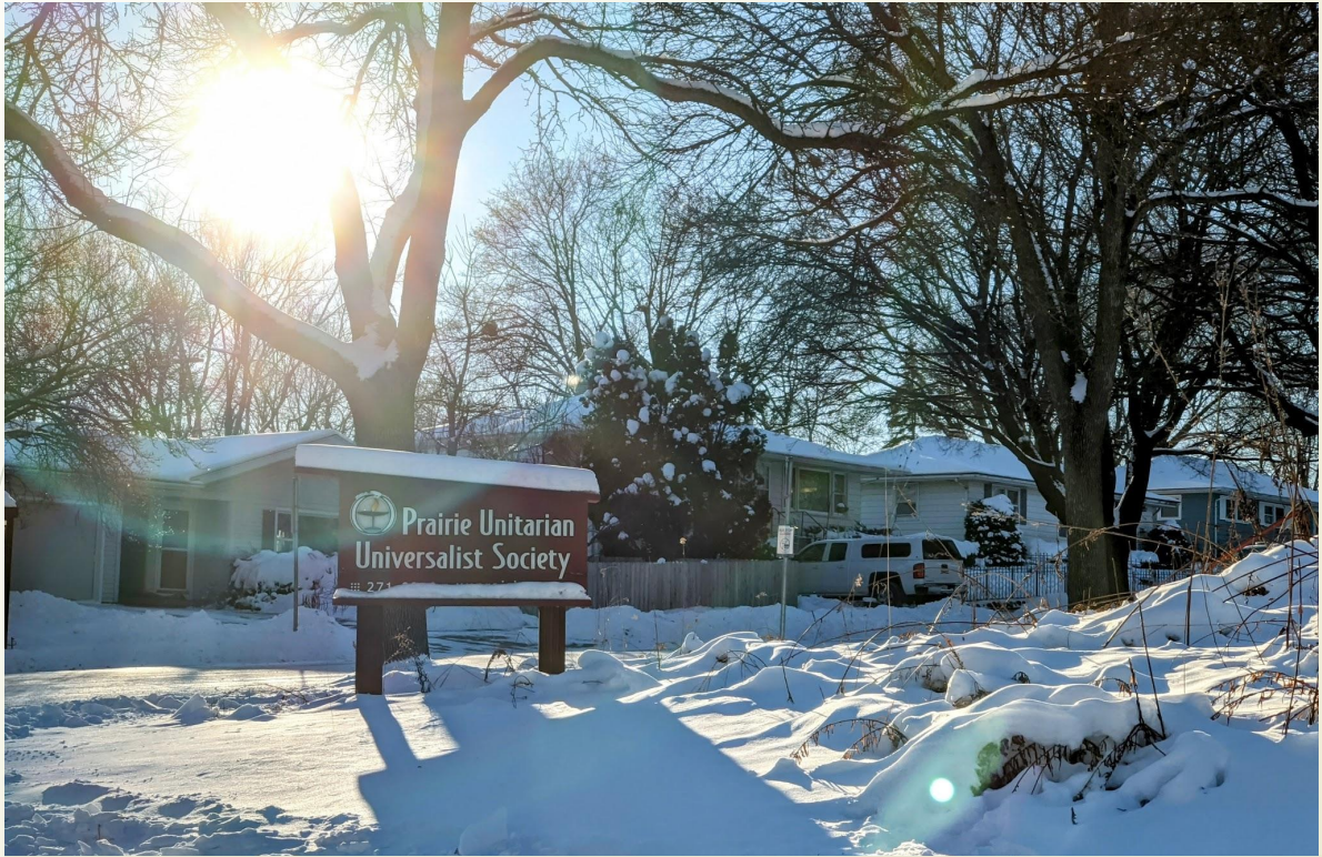
Prairie's sign and front yard covered in a blanket of snow and backlit by the winter sun.