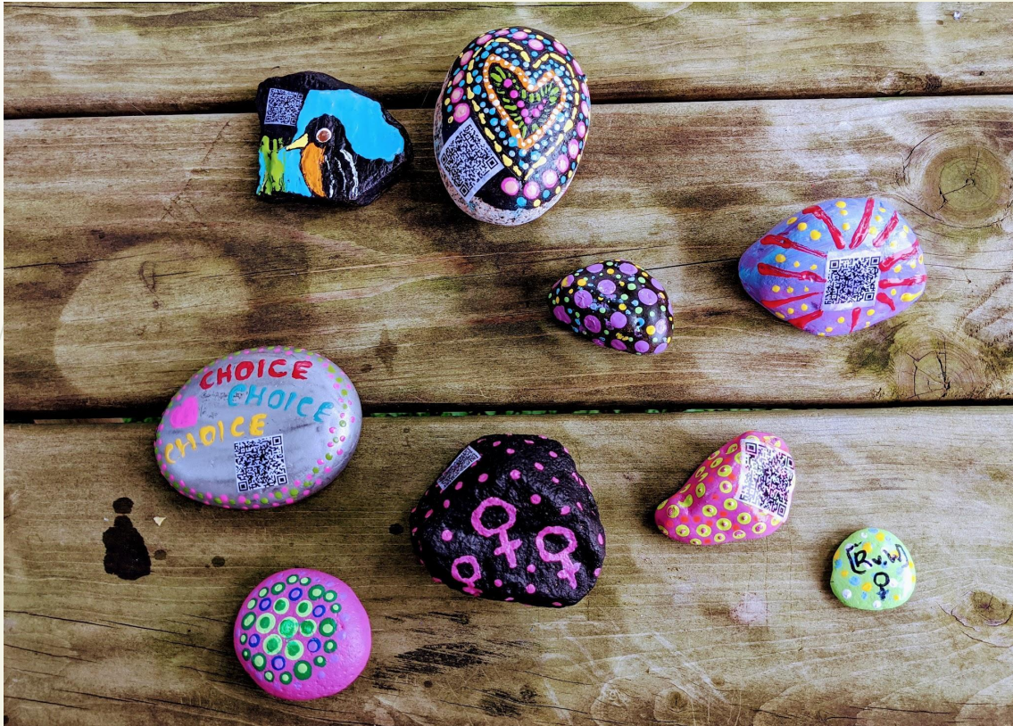
Rocks painted to spread information about reproductive justice. To read more about this art, see the article on page 6.