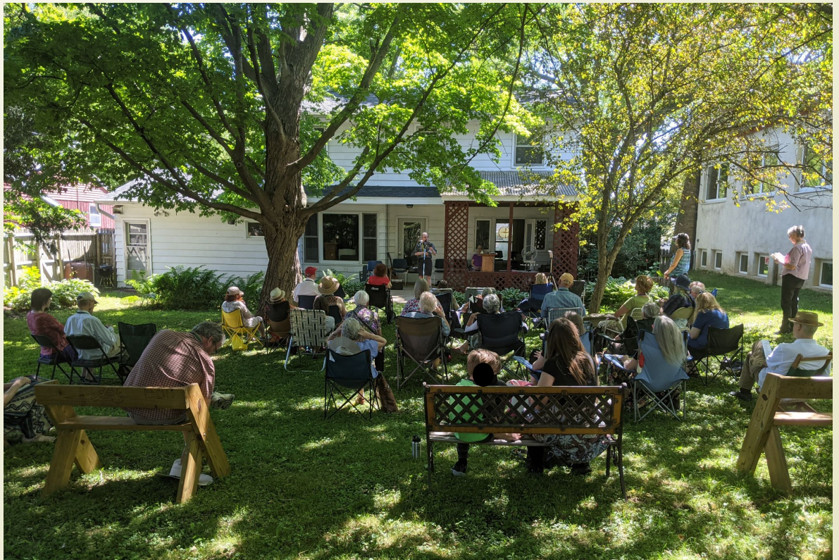
Our first 2021 outdoor service on June 13th featured poetry.