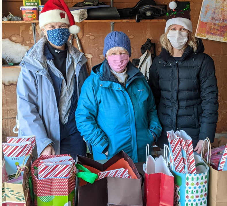
Nifty Gifty elves with the craft kits they assembled together in Karen's garage