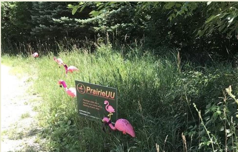
A Prairie flamingo flock travels