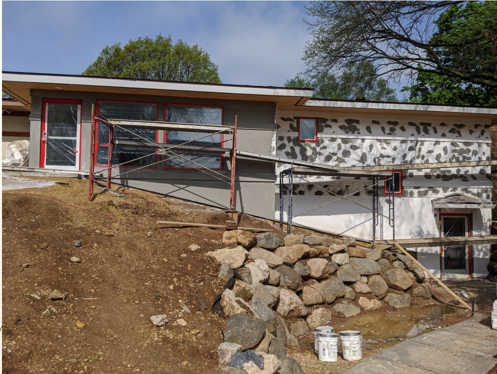
2010 Whenona on 5/24/20