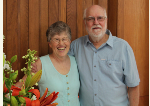
50 th Anniversary Celebration at Prairie, June 2016