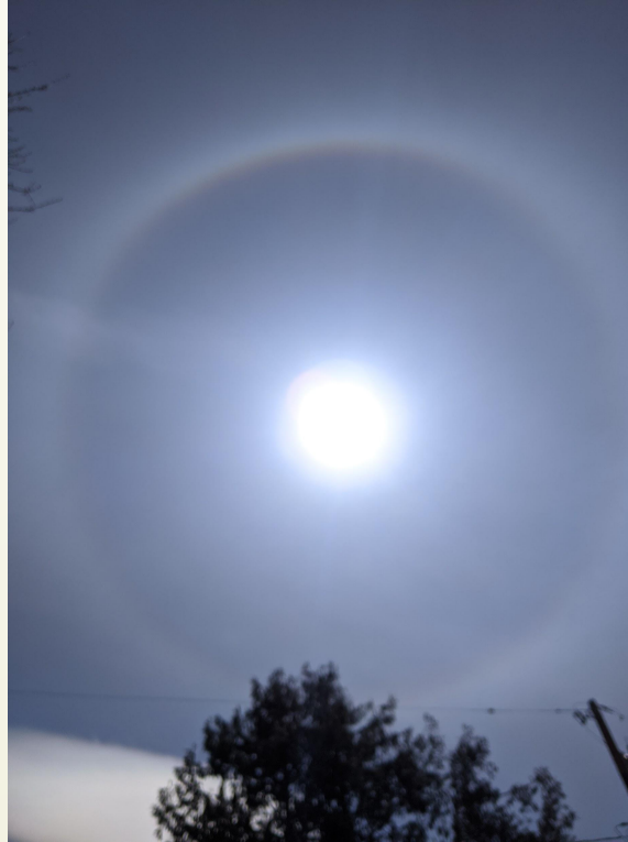
Sun halo in Madison on 4/20/2020