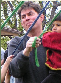
Maypole dancing, around 2005