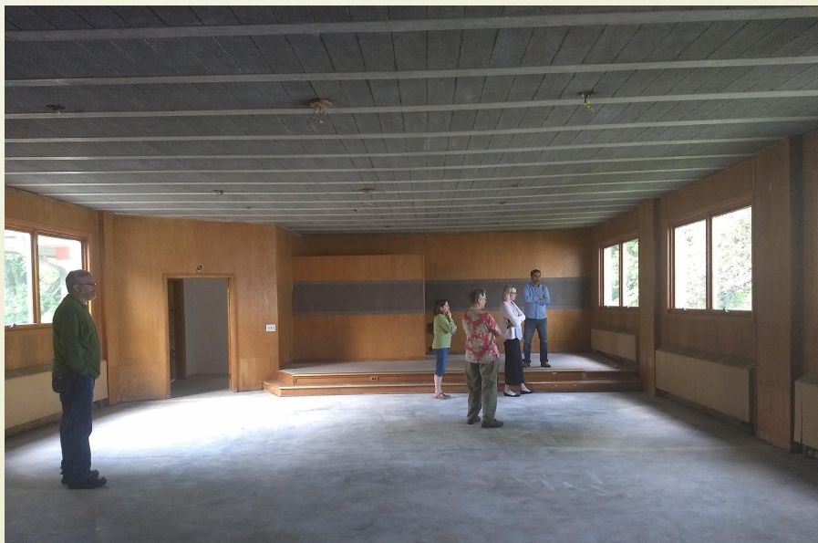
Post asbestos removal, members of the Design Sub Committee discuss ideas for the floor, walls and ceiling on June 4th 2019

If you want to take progress pictures to document the new and remodeling work. Please contact Tom Robinson prior to visiting the site for an appropriate time to do this. More than likely this will be limited to weekends when no construction workers are around.