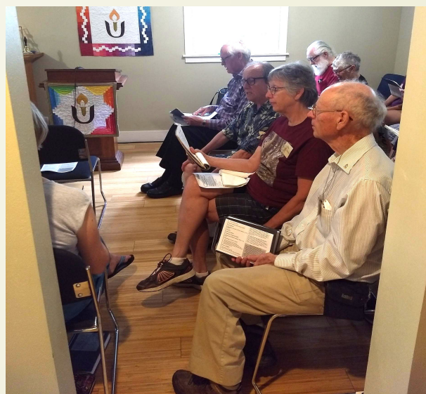
Final service in the Annex on July 21st 2019.