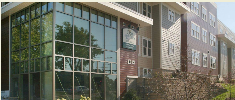
Oak Park Nakoma 4327 Nakoma Rd