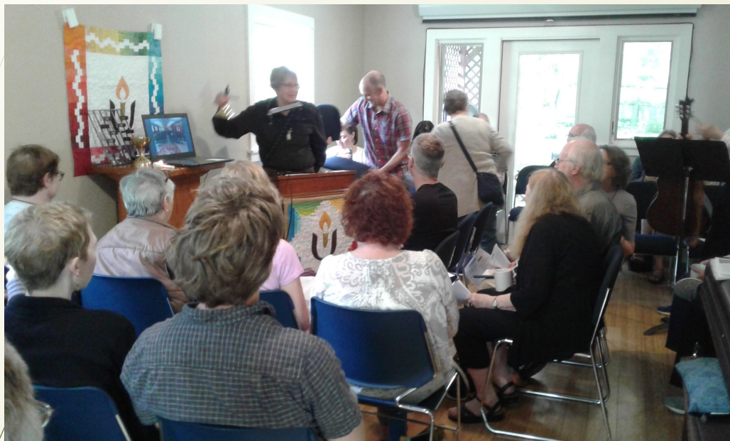
First service “If These Walls Could Talk” in the Annex on May 26th 2019.