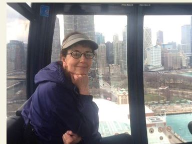
Chicago Ferris Wheel

*Please email prairiefire@uuprairie.org to suggest a future member to spotlight